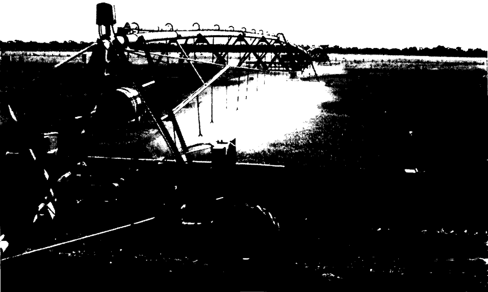
A spray irrigation system being used to study the growth of rice under intermittent irrigation. Rice uses a large proportion of the irrigation water in south eastern Australia and reducing the quantity applied will increase the efficiency of production and reduce accessions to the groundwater.

CSIRO—Division of Environmental Mechanics