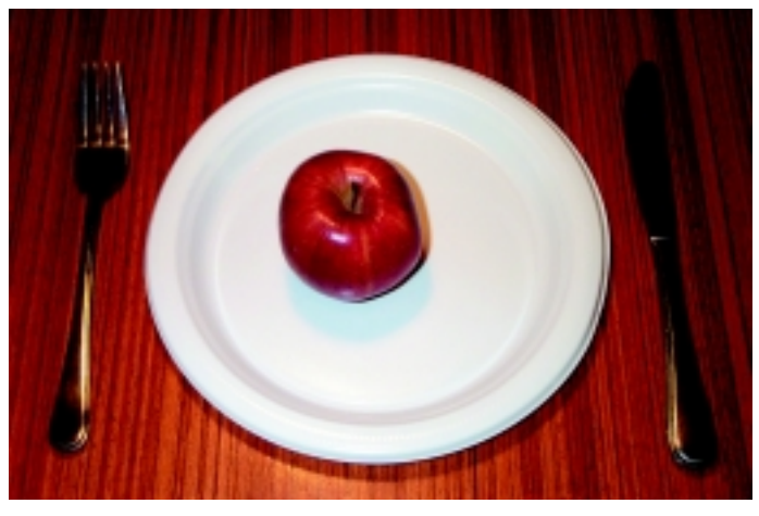
1 serve of apple