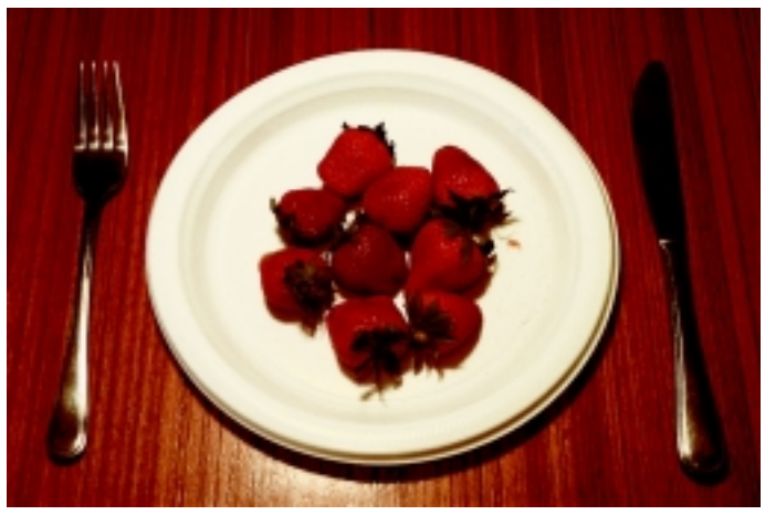
1 serve of strawberries