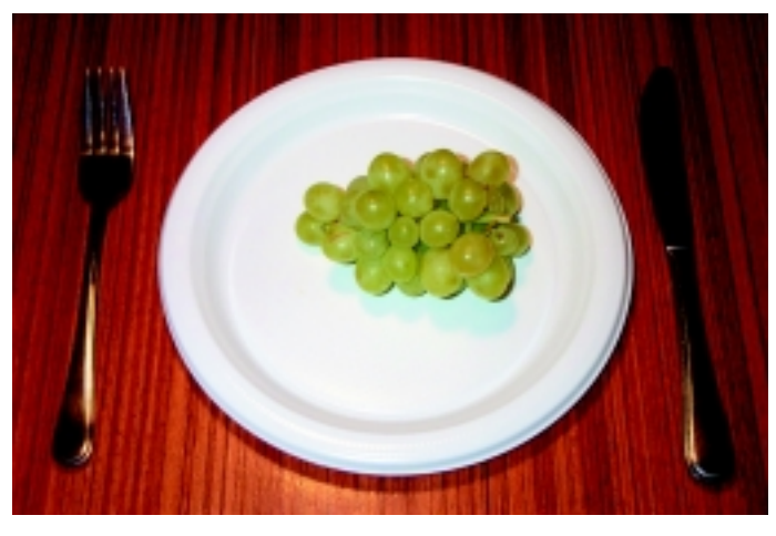
1 serve of grapes