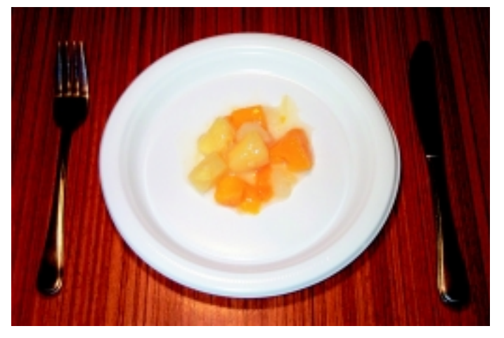
1 serve of fruit salad