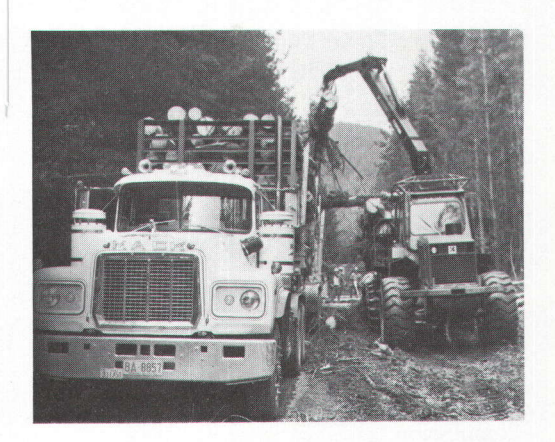
Logging operations in a pine plantation

The second stage began in 1961. The continuing demand for long-fibre conifer pulpwood, to serve an expanding pulp and paper industry, saw the extension of planting into areas of low quality native forest. Radiata pine plantations now provide a large part of Australian-grown wood supplies. Large scale establishment of these plantations was commenced by State Governments early this century. In the 11 year