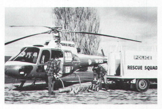
Search and Rescue Squad members prepare for take-off on 4 January 1985 for the snows of Cradle Mountain to rescue a bushwalker who had broken his ankle.

Over the 1984–85 summer season, 17 stranded canoeists and rafters were winched from the dangerous gorges of the Franklin River.