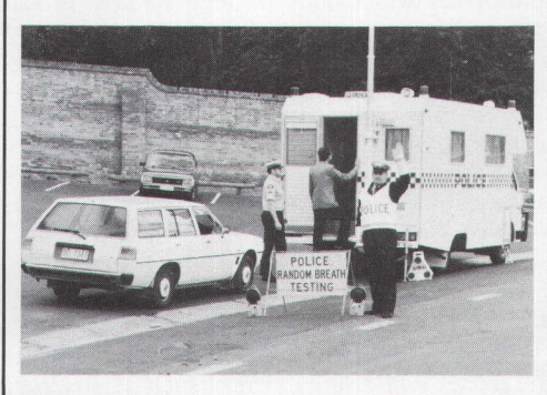
A familiar sight on Tasmanian roads, the Mobile Breath Analysis Unit conducting random breath tests.

Motorists are selected at random and requested to undergo a breath test by blowing into the Drager portable digital readout screening device; new mouthpieces are used each time. If the result of the test is negative, the motorist can drive on. If positive or borderline, a full breath analysis on a Breathalyser machine may be required and will be conducted in the Unit or at a city police station.