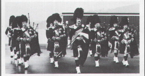
The Tasmania Police Pipe Band on parade.

In addition to their Tattoo performances, the band made history when they were the only band ever to be invited to take part in a Festival street parade with the Edinburgh Pipe Band. They also participated in a parade in Glasgow and a charity performance at a hospital.