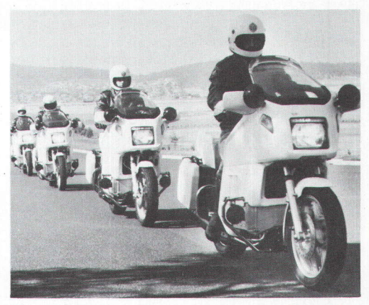
The BMW K100s used by the Force are specially modified for police work. They have a top speed of 215 kmph and their low mass and centre of gravity give them safe handling, even at these high speeds.

The aim of Tasmania Police Traffic Patrol is to keep traffic moving safely on our Tasmanian roads. They detect traffic offenders, illegal parking, control the streets during parades, provide escorts for VIP visitors and overwidth vehicles and assist at accident scenes.